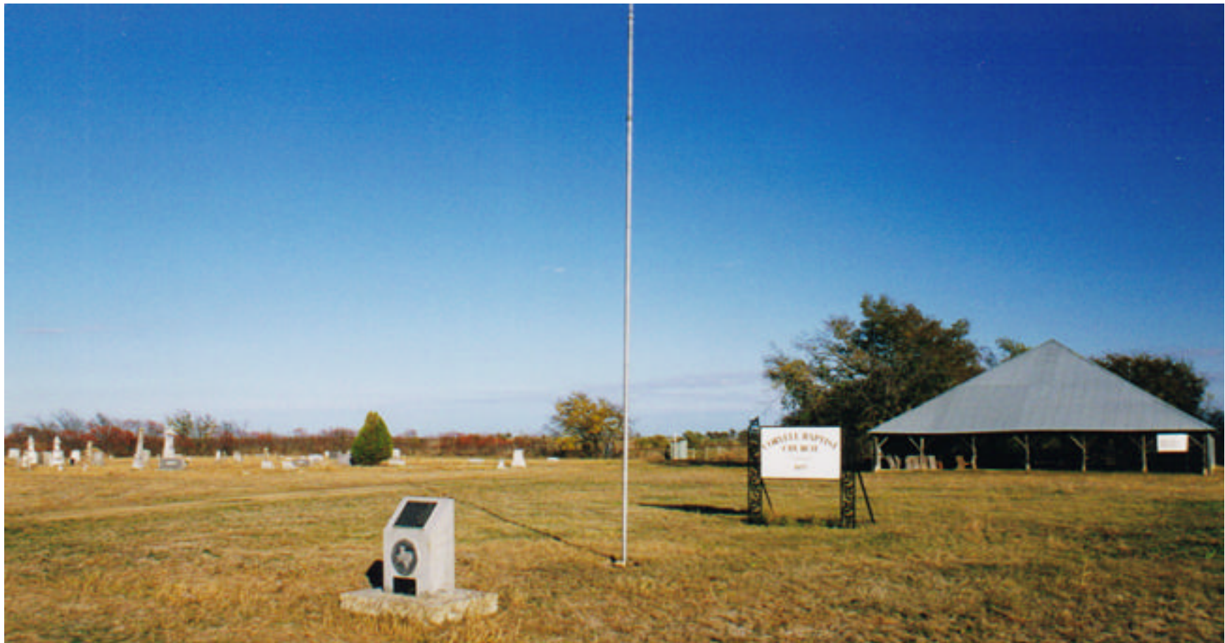
Coryell Missionary Baptist Church Cemetery, FM 929 & FM 185, north of Oglesby in Coryell Co., Texas on Nov. 28, 1997