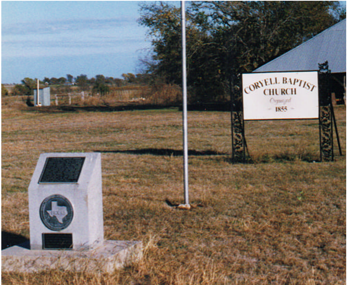
Coryell Baptist Church Cemetery, Coryell Co., TX, Nov. 28, 1997