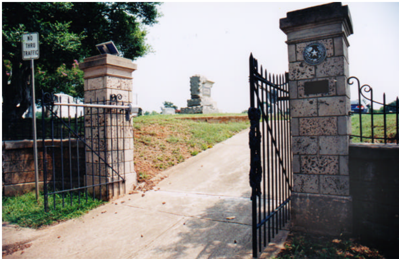
Oakwood Cemetery, Oakwood at North Palace Sts., Tyler, Smith Co., TX, 7 Jul 2002